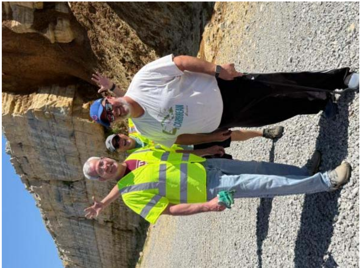
Community in Action!

The South Oldham Rotary Club rolled up their sleeves and made a difference last Sunday by picking up 16 bags of litter on Veterans Memorial Parkway.